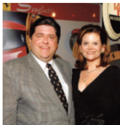
J.B. & M.K. Pritzker